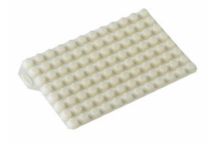
Figure 2. Example of a FluidX TPE Septum Cap Mat for liquid.