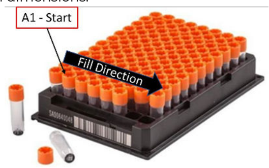
Figure 1. Example of a 2D data-Matrix barcoded tube and associated storage rack for liquid.

Unique Tube Label ID – A required field in the completed digital manifest, either a 2D barcode, 1D barcode, or human-readable identifier. Must be unique across all samples within a given project. The label is legible, is typically 8 to 15 characters in length, and fits within the tube label dimensions.